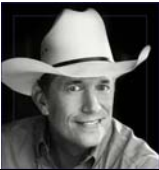
Strait to Exemplary